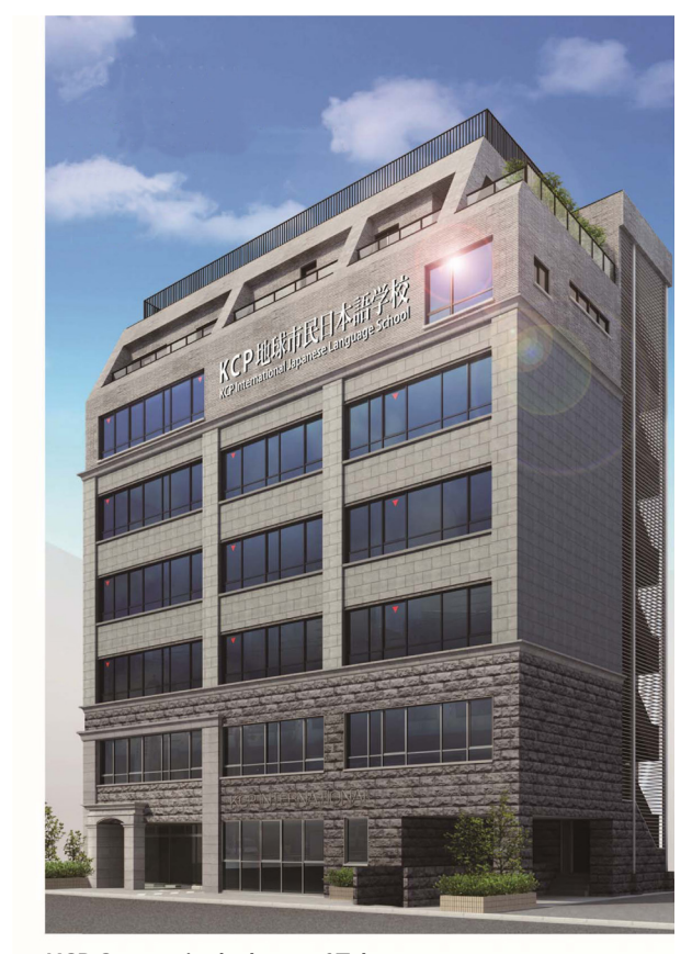
KCP Campus in the heart of Tokyo

I expected to be able to hold basic conversations in Japanese by the end of the program, but I was actually surprised. I became able to participate in quite complex conversations with most of my Japanese friends.